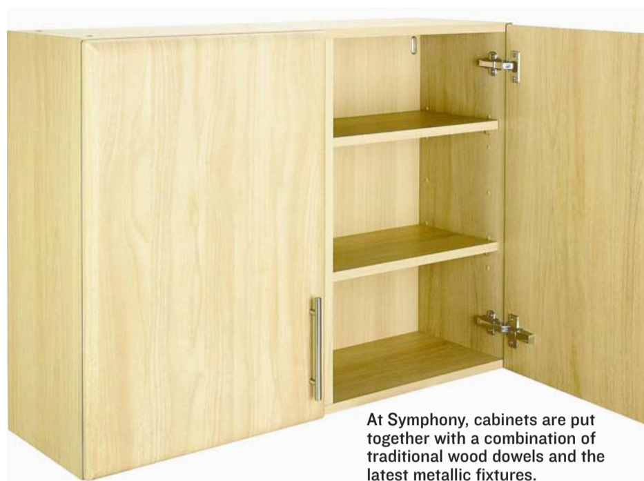
At Symphony, cabinets are put together with a combination of traditional wood dowels and the latest metallic fixtures.

kitchen cabinets is attributable to its low cost compared to MDF or plywood especially where appearance is not the main consideration. Paper is usually used as an overlay for the raw particleboard to keep costs down.