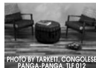
CONGOLESE PANGA-PANGA, TLF 012